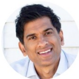
DR RANGAN CHATTERJEE